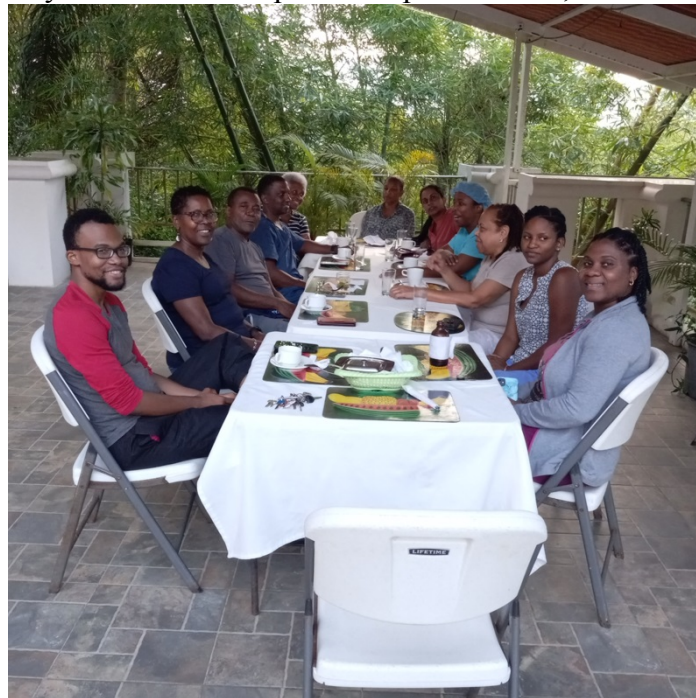
(The empty chair, the photographer)

It was another big challenge, of the kind we have been painfully facing over the last two - three years with quite some frustrations, which forced us to limit our usual crowd of 20-25 of multiple specialties to provide the most diverse services for our less fortunate brethren, to a reduced team of 8 volunteers, joined by 4 valiant local ophthalmology practitioners, and an engineer: