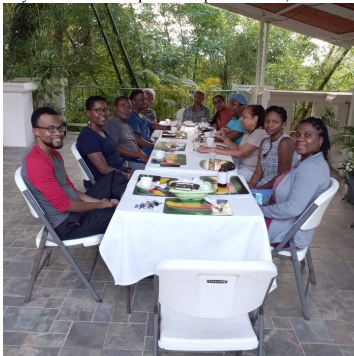
(The empty chair, the photographer)

It was another big challenge, of the kind we have been painfully facing over the last two - three years with quite some frustrations, which forced us to limit our usual crowd of 20-25 of multiple specialties to provide the most diverse services for our less fortunate brethren, to a reduced team of 8 volunteers, joined by 4 valiant local ophthalmology practitioners, and an engineer: