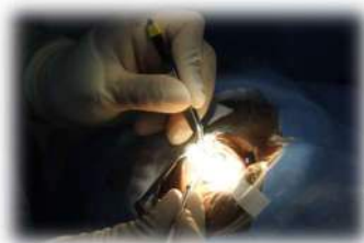
& so were our team and operating staff