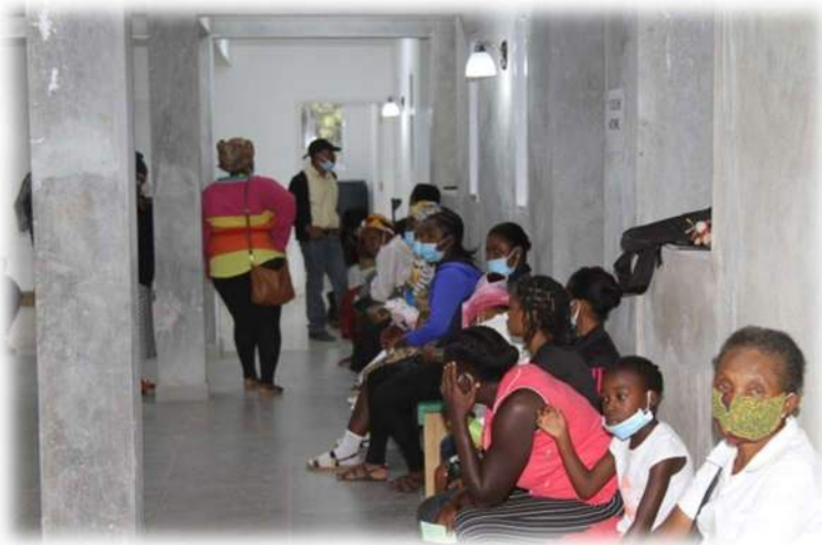
Patients waiting within our new spacious outpatient clinic

We also had the opportunity to assist two Interns doing their one-year-long Social Services in EKG, ultrasonography, etc., which was quite far from meeting our objectives.