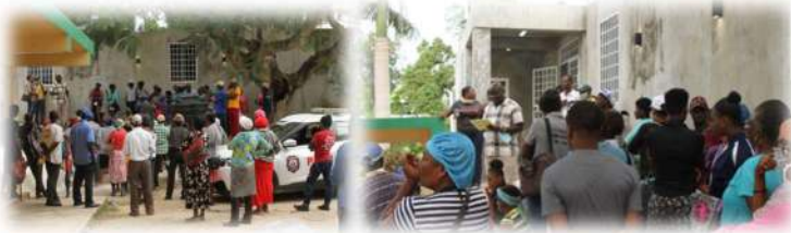
The crowd, as usual, was at the Rendez-Vous...