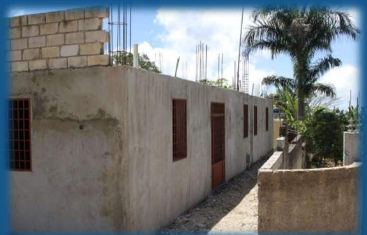
The Outpatient Clinic is still under construction, with Electrical & plumbing underway.

We pray the circumstances will encourage us to bring a near entire team, 15-20 volunteers ( Vs. 25-30, usually ) for our summer 2022 mission.