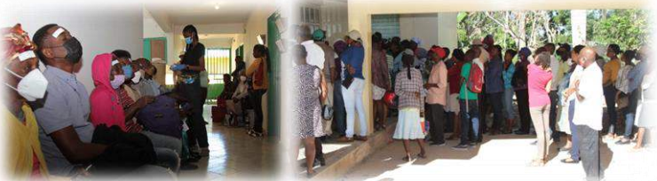
It's always busy and lots of traffic at the Eye Clinic