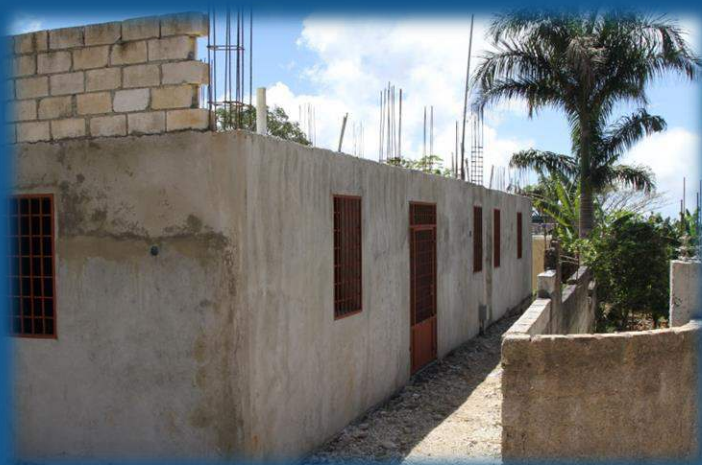
Picture of the first floor of the outpatient clinic

The final touch is underway for electricity and plumbing for the outpatient clinic.