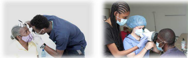
We provide eyecare training for our volunteers & locals