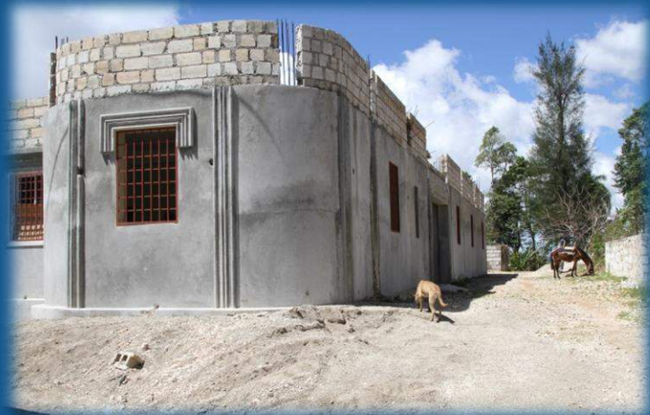
St-Joseph Hospital Outpatient Clinic – Under Construction